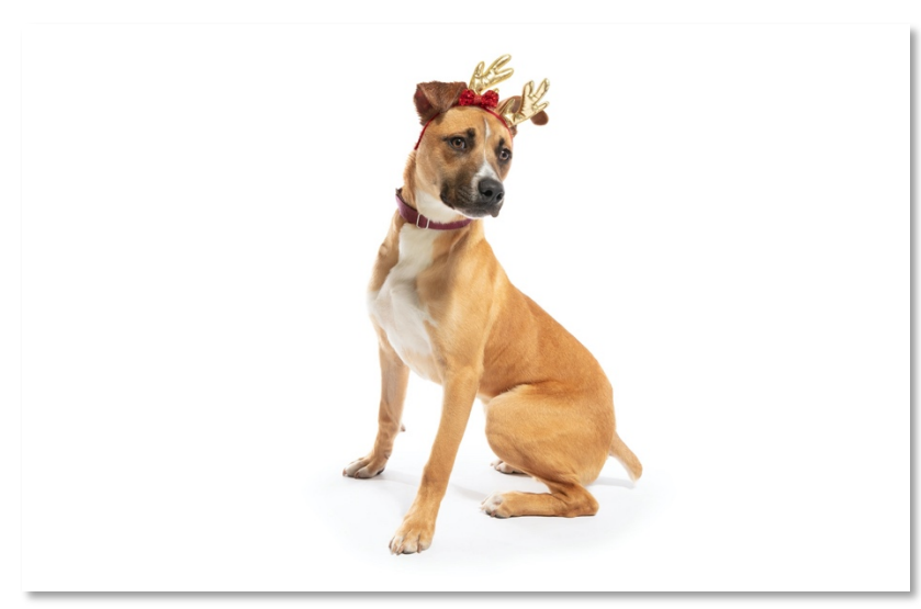
Image Caption: Zodiac getting ready to spend Christmas in his forever home